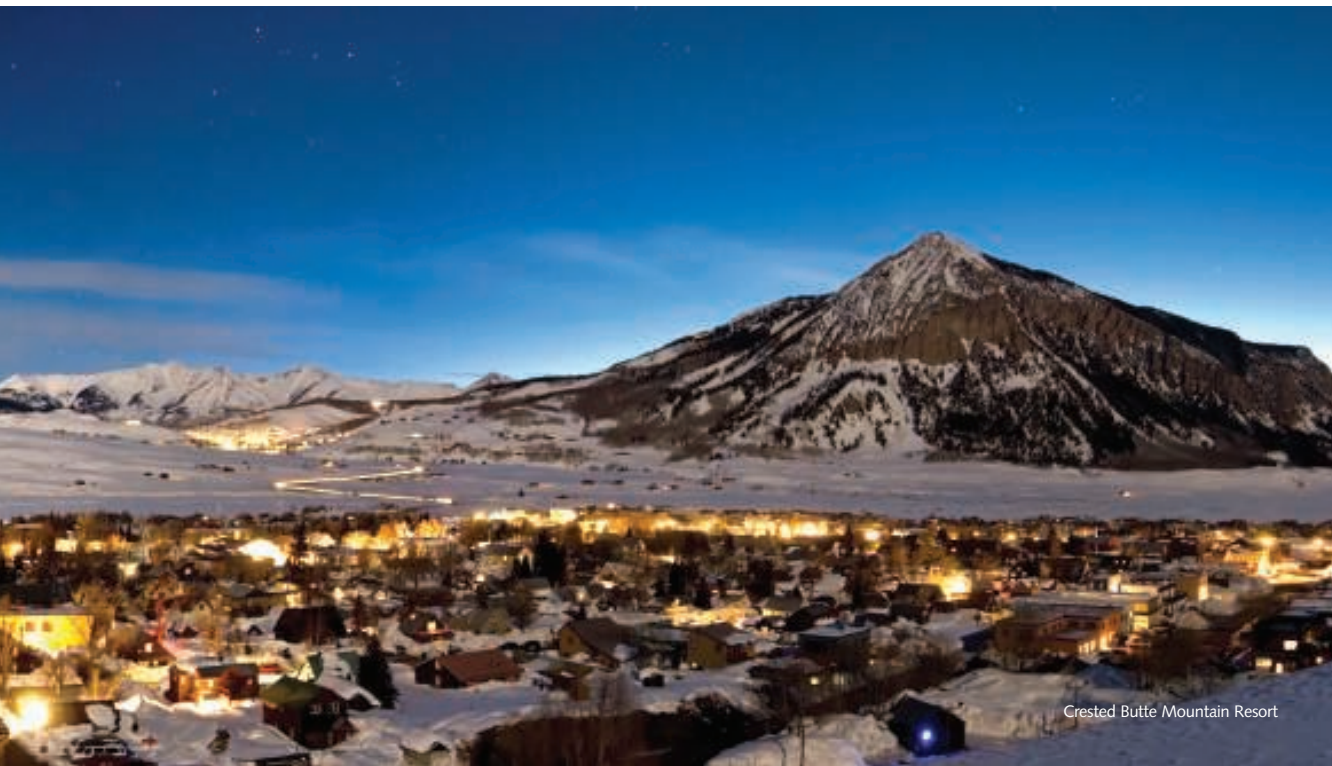
Crested Butte Mountain Resort